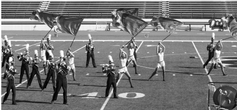
Above: The Algona Scarlet Regiment Marching Band competing at State in Fort Dodge on October 9th.

The Bulldogs' next cross-country meet is next Thursday, October 21st, in Denison. Go Dogggggggggggggggggggggg!